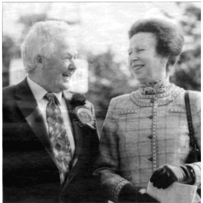
A royal visit by Princess Anne helped swell numbers at the 2008 Royal Welsh Show.